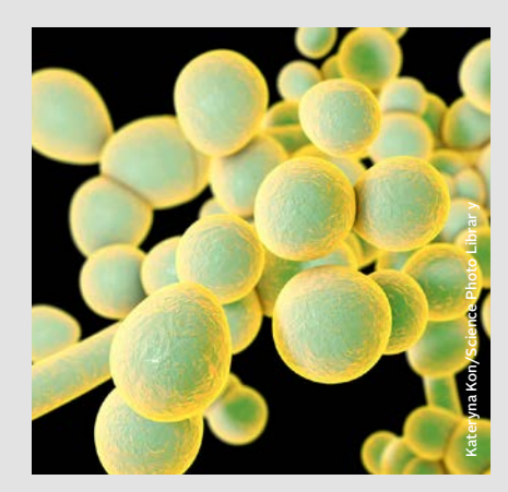
Some strains of the Candida aurus fungus (above) are resistant to all three major classes of antifungal drugs.