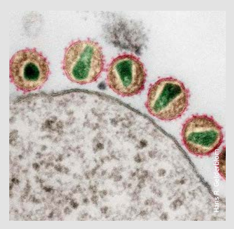
The HIV virus (above) has been identified by WHO as a priority for strategies to address AMR.