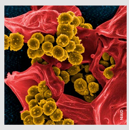
Most infections with Methicillin-resistant Staphylococcus aureus (MRSA, above) occurr in a hospital setting.

New and adapted medicines targeting different pathogens must take into account their modes of resistance. Resistance mechanisms can comprise, for example, structural changes in or around a medicine's target molecule; reduced permeability of the cell membrane to the medicine; and the production of enzymes that inactivate the medicine.