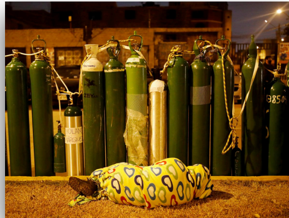
Peru, February 2021

While liquid oxygen industry leaders acknowledged the significant capital infrastructure required and long lead times (two to five years) to establish new air separation units (ASUs) in LMICs, they also stated that where the infrastructure exists it is relatively easy to generate additional oxygen supply. What is challenging is getting that supply to LMIC hospitals and ensuring that they are equipped to store and pipe it to bedside or to fill cylinders safely, as liquid oxygen is highly flammable. Typically an existing ASU can serve hospitals within a 300km/190mile radius and if hospitals have the financing, the infrastructure, and the staff to secure and manage a liquid oxygen supply they should not experience shortages, even during a pandemic. Negotiating supply with hospitals in the geographic footprint of liquid oxygen plants is “very feasible” and the focus should be to keep contracts, “simple and safe.”