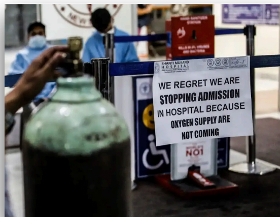
India, April 2021

Agencies appreciated the need to sustain new investments in oxygen beyond the pandemic and acknowledged that this will also help to reduce deaths from many other causes including infectious diseases (e.g., pneumonia, malaria, tuberculosis) and chronic diseases (e.g., COPD), and improve outcomes for patients needing surgery. Greater access to oxygen will also benefit patients across the life course, from newborns in respiratory distress to elderly patients with chronic respiratory conditions. In this way, investments in oxygen will help LMICs achieve most of the Sustainable Development Goals (SDGs). This preferred approach was summed up by a taskforce member as, “saving lives in the short term and building the infrastructure to strengthen health systems over the long term.” Several taskforce members described their commitment to oxygen as long-term with one stating a capacity to “channel significantly more funding to oxygen.”